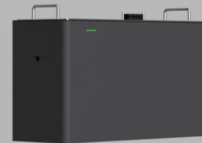
5.12kWh Battery Module