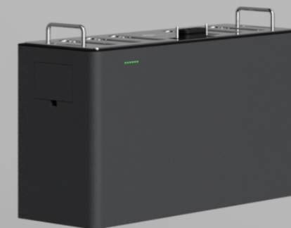
5.12kWh Battery Module